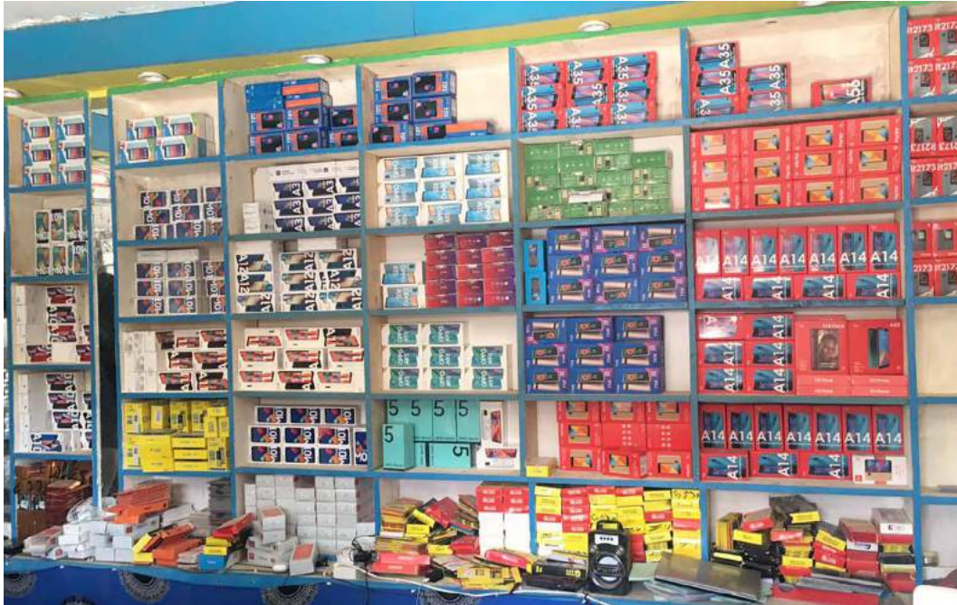
An electronics shop in Lasanod city.

corridor that straddles Somaliland and Puntland. Contested state-building projects and supply chains from Berbera and Bosaso ports shape the Lasanod trading border, which is inhabited by the Dulbahante clan family. 7