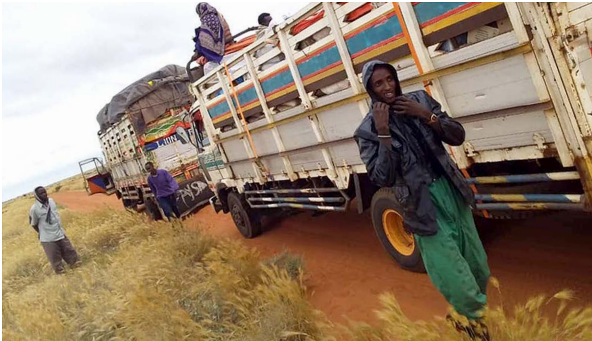
Trucks travel along minor roads in the Gaashamo trade corridor.

As in the rest of the world, cross-border trading in the Somali Horn of Africa is recurrently distinguished between a 'formal' and an 'informal' variant. From a legalistic and state-viewpoint the bulk of everyday commodity trading—as for example in the Gaashamo, Lasanod and Galkayo trade borders—falls into the informal category. However, borderland specialists have for long, and so far with limited success, cautioned against labelling this type of trade as 'informal'. 55 Our studies highlight that the regulation of cross-border trading across the Somali territories cannot be understood by a dichotomy of formal versus informal. In reality, trade is governed and regulated in a variety of ways, which cut across formal and informal, legal and illegal, regular and irregular categories. 56