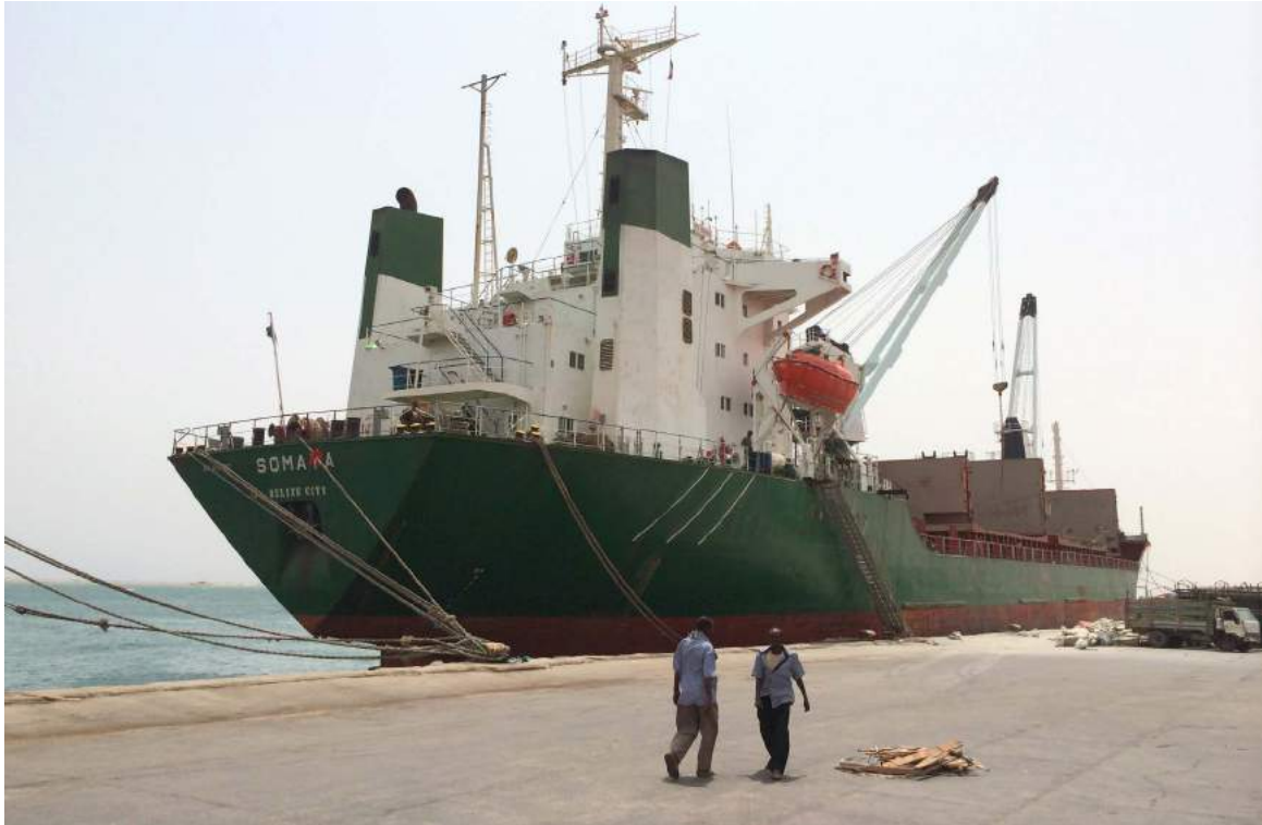
A ship docks at Berbera port.

to expand their public authority by taxing economic transactions. The same applies to the former Islamic Courts Union (ICU) and tax collection by al-Shabaab in the past 15 years. 25