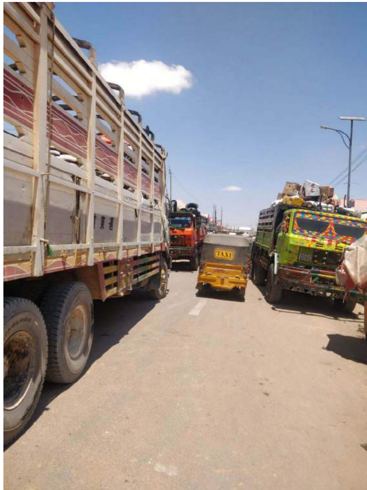
Trucks wait in central Galkayo.